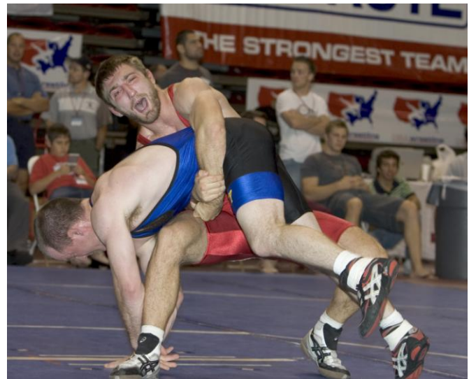
New rules in Greco-Roman emphasize par terre techniques

Notes: 1 The All-Russian Scientific Research Institute of Physical Culture and Sports, Moscow, Russia; 2 The All-Russian Scientific Research Institute of Physical Culture and Sports, Moscow, Russia; 3 The All-Russian Scientific Research Institute of Physical Culture and Sports, Moscow, Russia